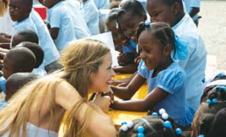
■ HHF Founder, Petra Nemcova, with students at Foyer des Archanges