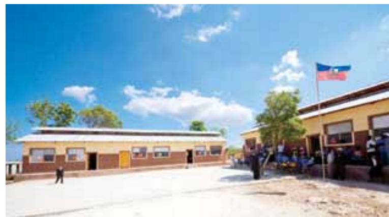
■ Snapshot of "Ecole Presbytérale de la Fraternité de Gros Mangles (La Gonâve)"