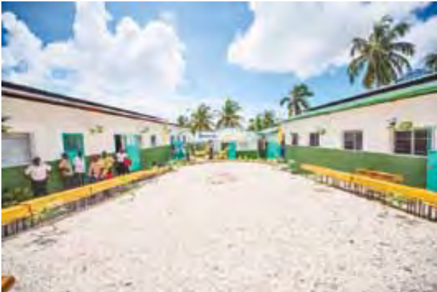
Snapshot of "Ecole de la Cooperative des Planteurs de Vetiver de Debouchette"

As the great adventure continues, the Foundation is sometimes led to places where access is difficult and bringing construction materials can be regarded as a real feat. Nonetheless, the Foundation does not back down when facing such obstacles as it is determined to