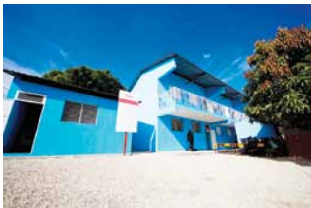
■ Ecole Etam Croix des Bouquets

Lastly, the Foundation was delighted to sign a memorandum of understanding with the Ministry of Education in order to build 10 national schools- one per department. The selected sites are very interesting and the Digicel Foundation will soon be bringing change to the lives of the hundreds of students set to attend these new schools.