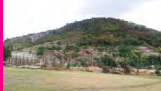
Snapshot of the area of CREFWA project

The Digicel Foundation also played an active role in the fight against cholera by funding Foundation Paradis des Indiens so that they could install 11 water wells to provide potable water to more than 3600 school children in les Abricots.