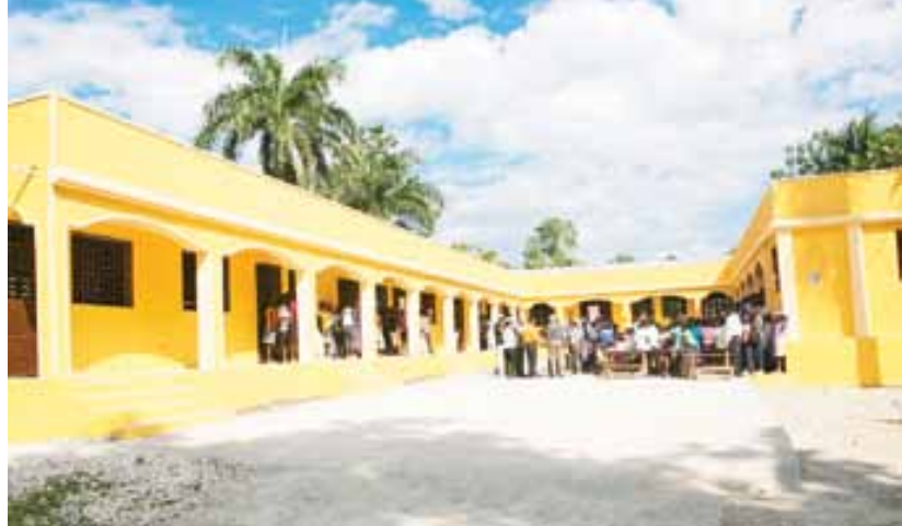
■ Snapshot of "Ecole Foyer des Enfants de Desbaves (Plateau Central)", financed by W. K. Kellogg Foundation