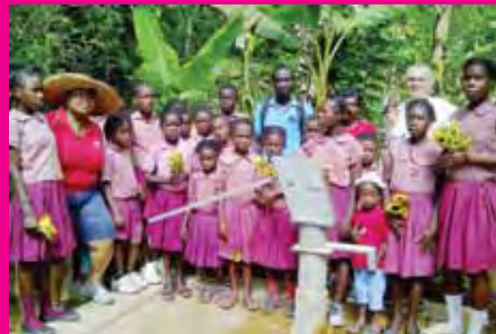
Some of the beneficiaries of the potable water project in les Abricots