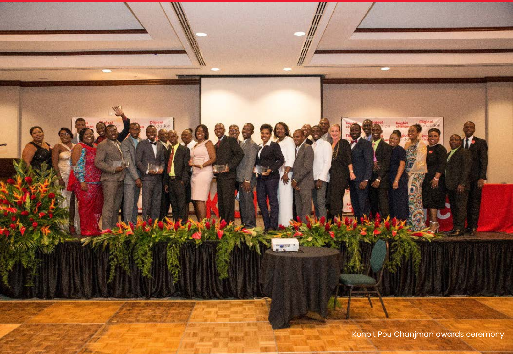
Konbit Pou Chanjman awards ceremony