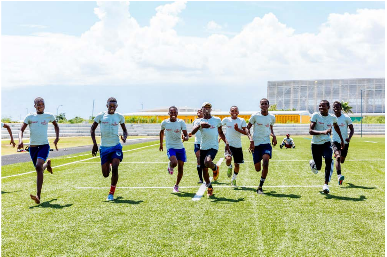
Special Olympics Haiti