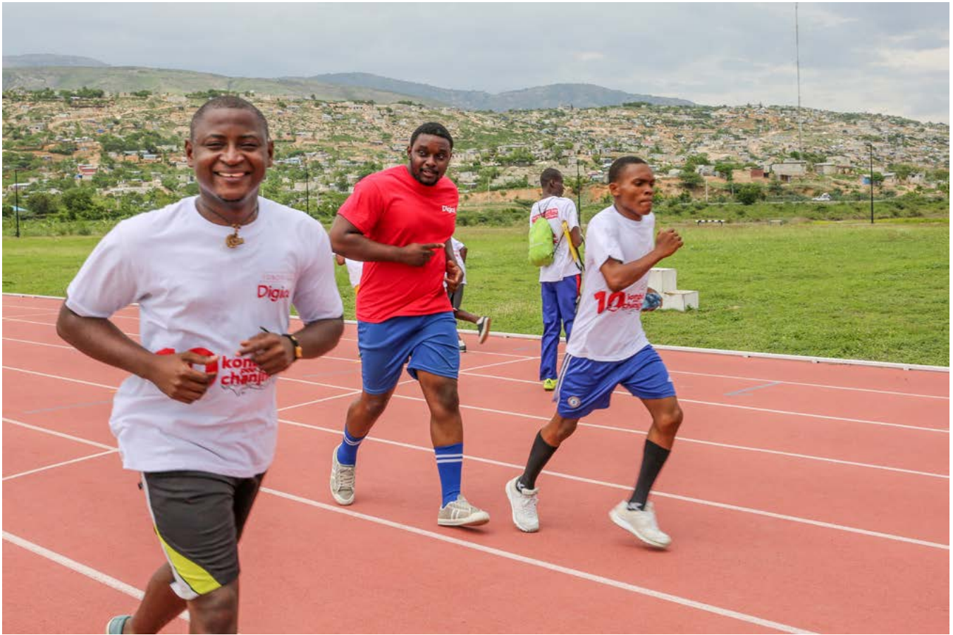
Unified sports day with Special Olympics Haiti