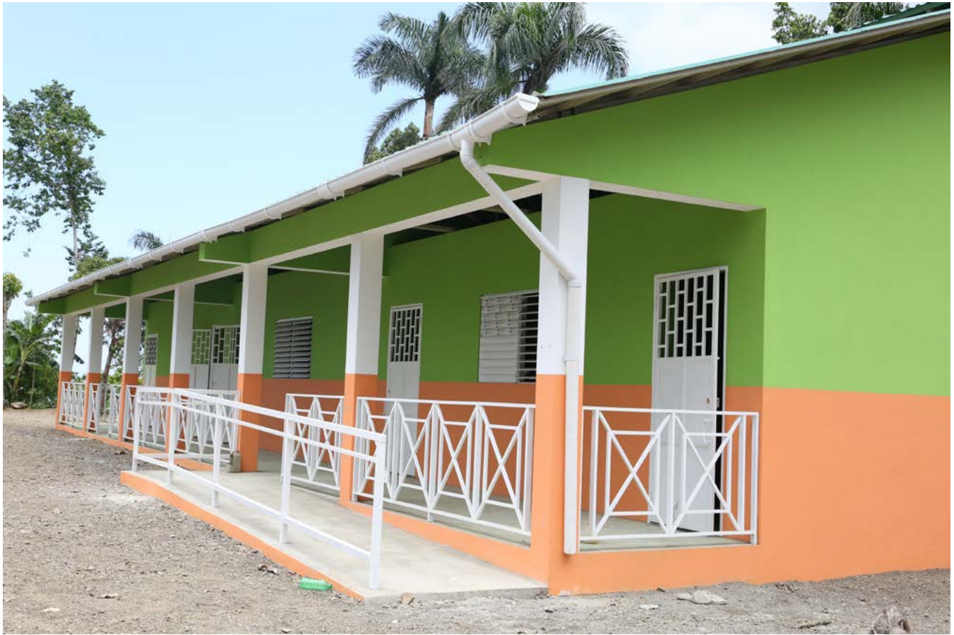
Ecole Notre Dame du Perpétuel Secours in Durissy