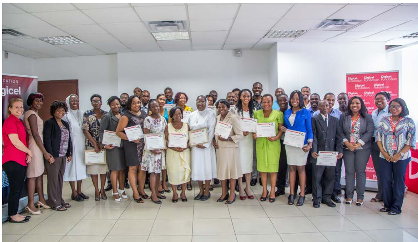
The 20 best teachers receiving certificates