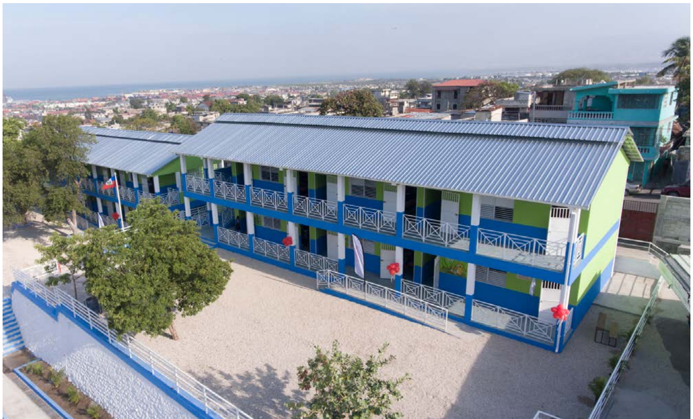
Ecole Congréganiste Nationale Notre Dame du Perpétuel Secours in Bel Air