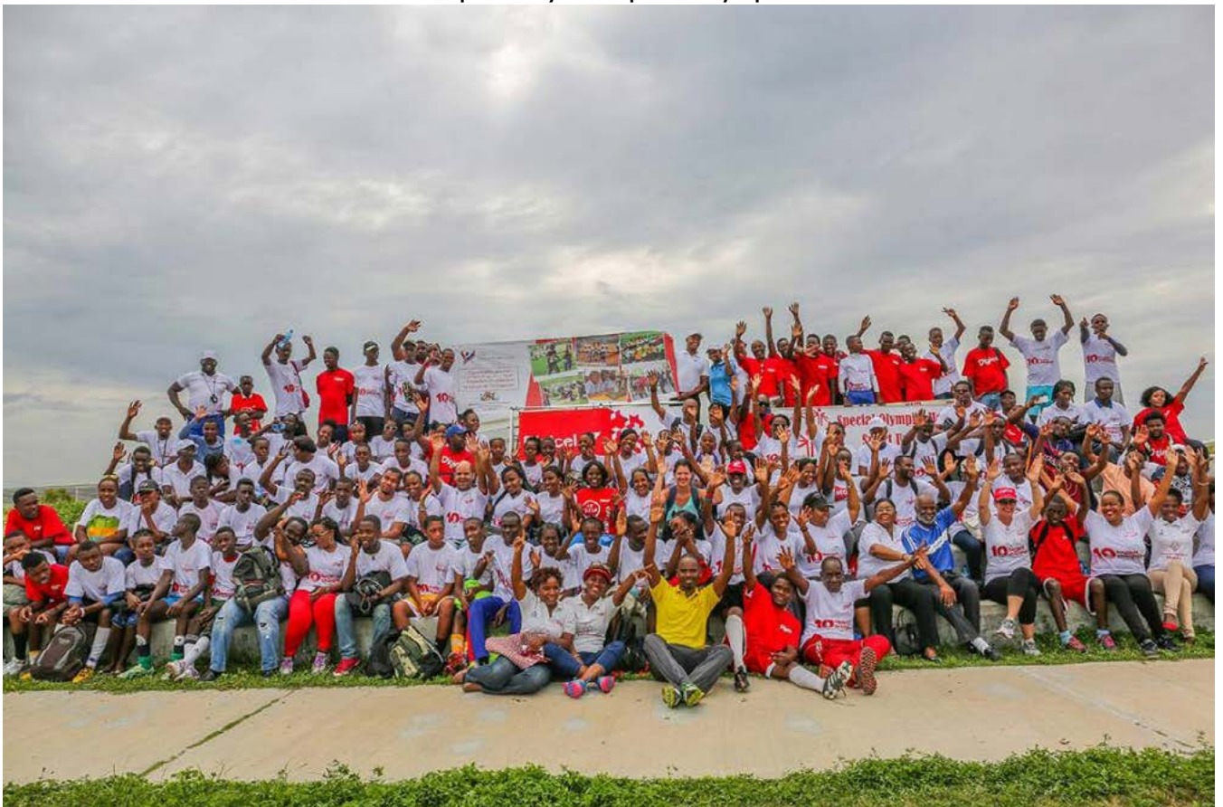
Closing of the unified sports day at Centre Sportif pour l'Espoir in Cité Soleil