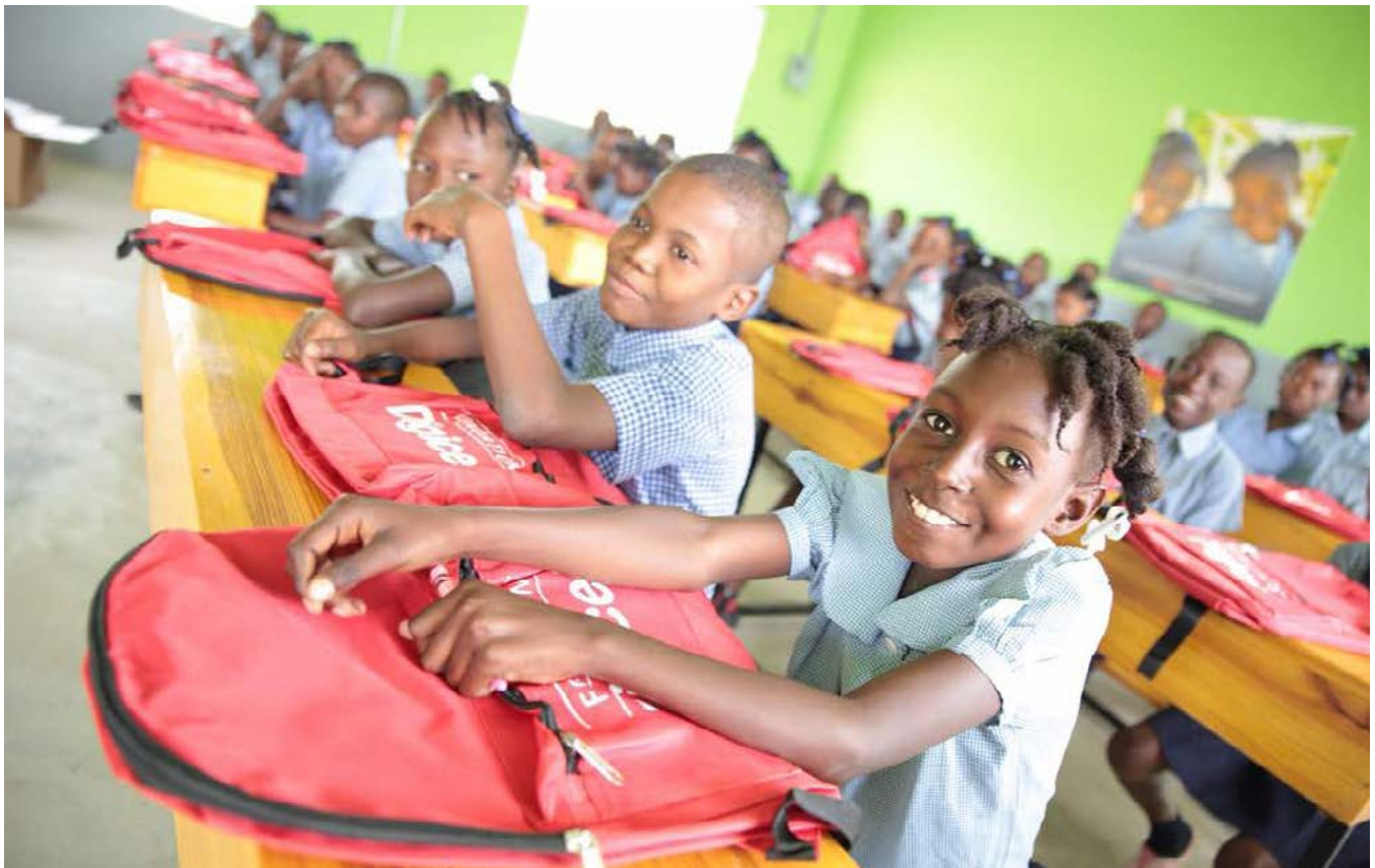
Ecole Nationale PJ Mara de Jolivert in Bassin Bleu