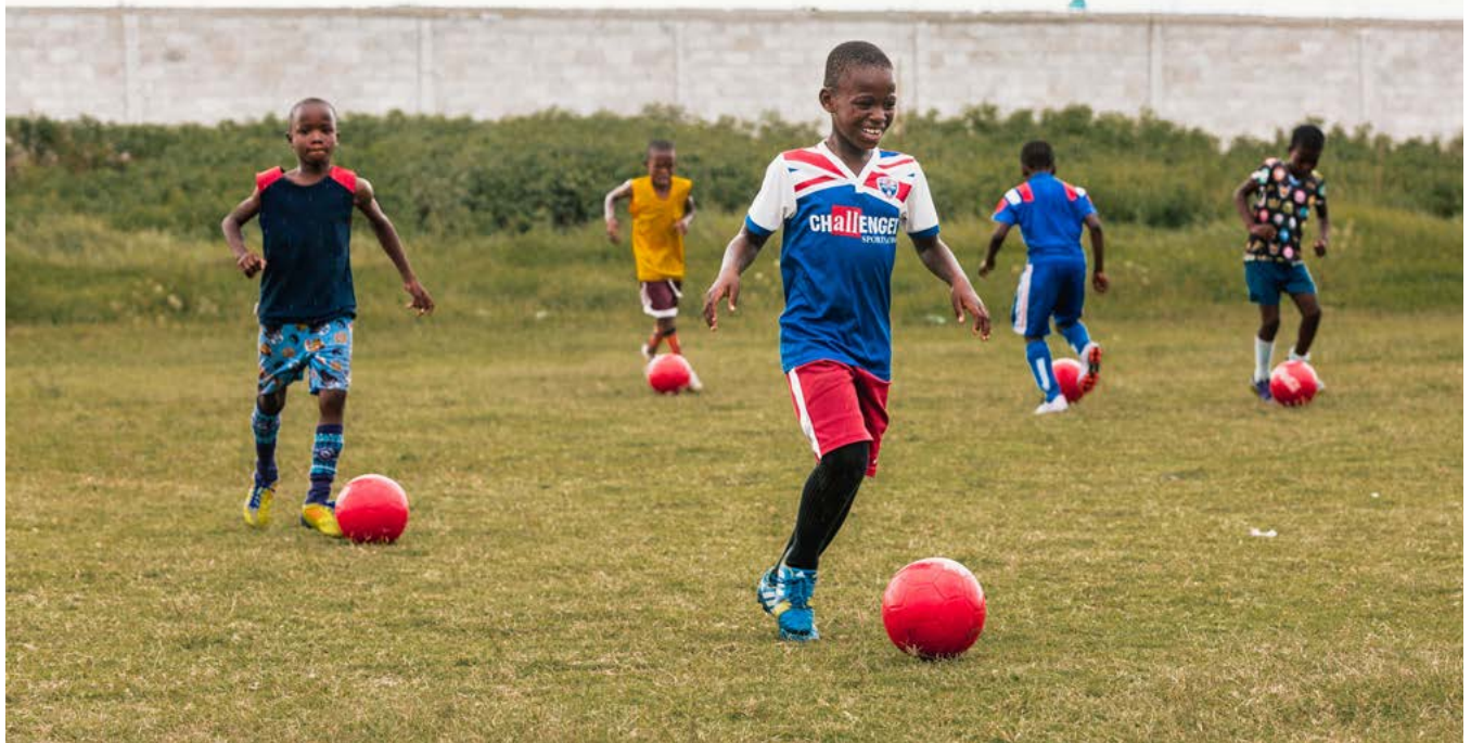
Fondation l'Athlétique d'Haïti