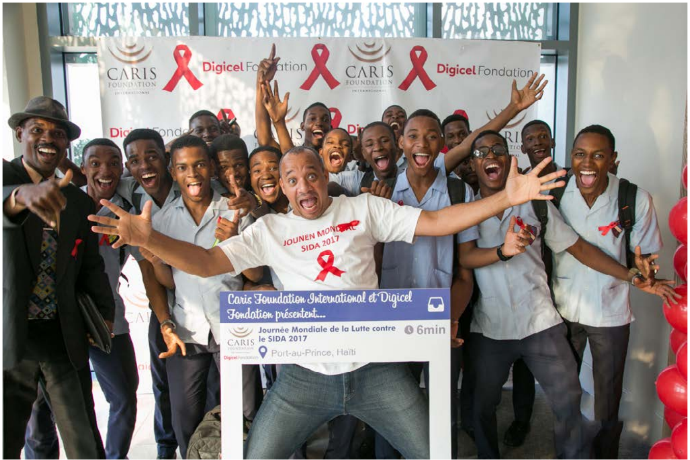
Engagement activity organized for World AIDS Day