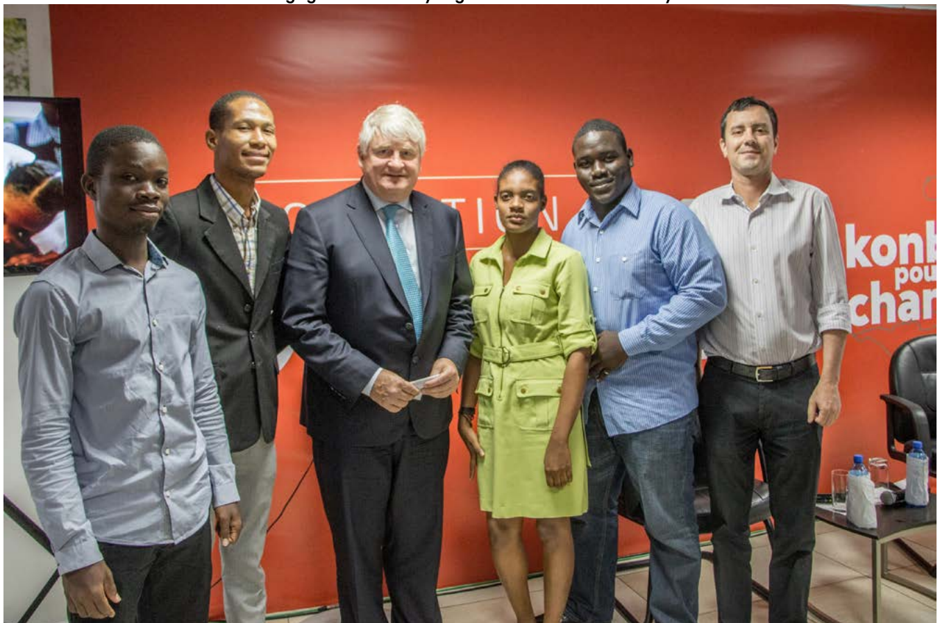
Activity organized for HELP students