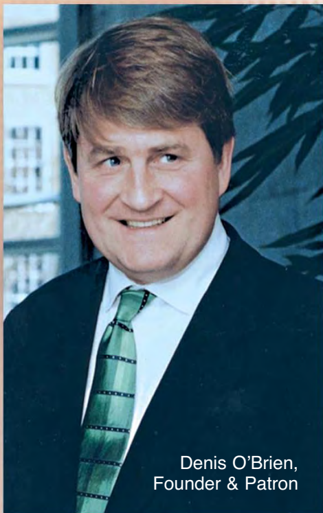
Denis O'Brien, Founder & Patron